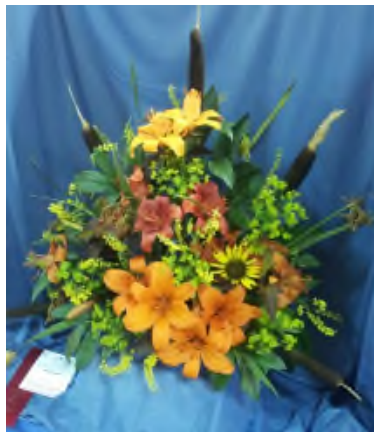
Best Floral Arrangement-Gladys Ning