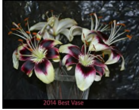
Best Vase-Phyllis Mueller