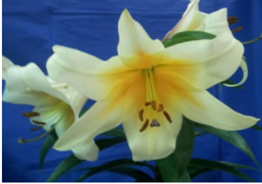
Best Div.VIII-non LA-Ron Sitter