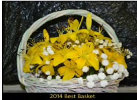
Best Basket-Phyllis Mueller