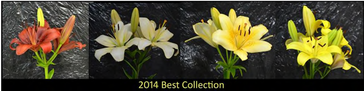
Best Collection-Pat Sargent