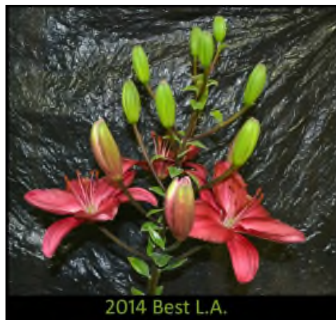
Best LA-Viola Berwald